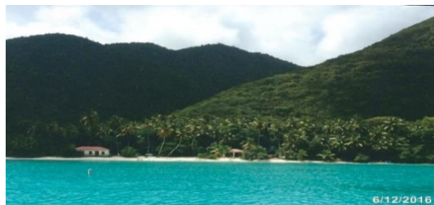
Maho Bay on St. John in the USVI. The Scouts slept on the deck of the boat, swam to the shore and grilled burgers on the beach

High Adventure: For the Troop's Scouts 14 and older, we have a high adventure program. Crews from T818 have sailed around the USVI, hiked the Cascades, canoed the Boundary Waters, trekked 106 miles across Philmont Scout Ranch, rallied with thousands of Scouts at the National Jamboree, and followed the path of Lewis & Clark up the Missouri River. These are memories of a lifetime.